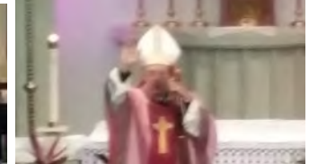
Blessing of the People of St. Michael