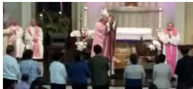
Blessing of Pilgrims to the 51 st International Eucharistic Congress