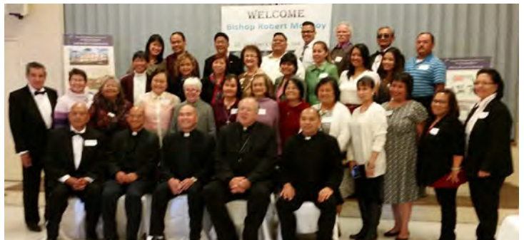
Meeting with members of the Parish Council

Saint Michael the Archangel, defend us in battle. Be our protection against the wickedness and the snares of the devil. May God rebuke him, we humbly pray; and do Thou, O Prince of the Heavenly Host - by the Divine Power of God - cast into hell, Satan and all the evil spirits, who roam throughout the world seeking the ruin of souls. Amen.