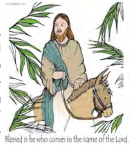
Blessed is he who comes in the name of the Lord.

What day is today? Ask most folks strolling home from church today and they will reply "Palm Sunday." Not too long ago, today was known as the "Second Sunday of the Passion," and in 1970 it was renamed "Passion Sunday." This made some sense, since the procession recalling Christ's entry into Jerusalem is usually only celebrated once in a parish on this day, but the Passion is proclaimed solemnly at every liturgy. In its most recent incarnation, the name for this day includes both aspects of the celebration: "Palm Sunday of the Passion of the Lord." In the United States today, most worshipers are provided with palm branches, although in northern Europe pussy willows are favored, and in Italy olive branches are the norm.