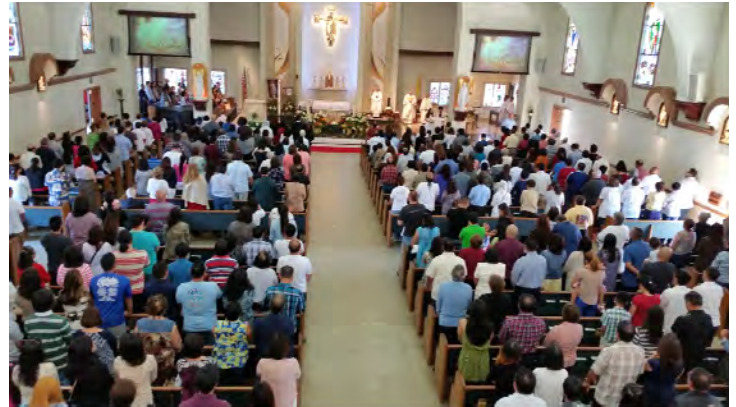
DIVINE MERCY SUNDAY—Feast Mass and Procession of the Holy Image.

Peter weep after his betrayal, and assured Paradise to the repentant thief. Let us hear, as if addressed to each one of us, the words that you spoke to the Samaritan woman: “If you knew the gift of God!” You are the visible face of the invisible Father, of the God who manifests his power above all by forgiveness and mercy: let the Church be your visible face in the world, its Lord risen and glorified. You willed that your ministers would also be clothed in weakness in order that they may feel compassion for those in ignorance and error: let everyone who approaches them feel sought after, loved, and forgiven by God. Send your Spirit and consecrate every one of us with its anointing, so that the Jubilee of Mercy may be a year of grace from the Lord, and your Church, with renewed enthusiasm, may bring good news to the poor, proclaim liberty to captives and the oppressed, and restore sight to the blind. We ask this through the intercession of Mary, Mother of Mercy, you who live and reign with the Father and the Holy Spirit for ever and ever. Amen.