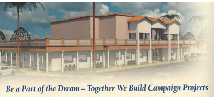
Be a Part of the Dream – Together We Build Campaign Projects