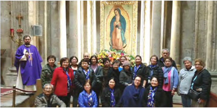
Pilgrims who visited Our Lady of Guadalupe in Mexico on December 9 to 16, 2016.

OFFICES CLOSED (Martin Luther King Holiday)