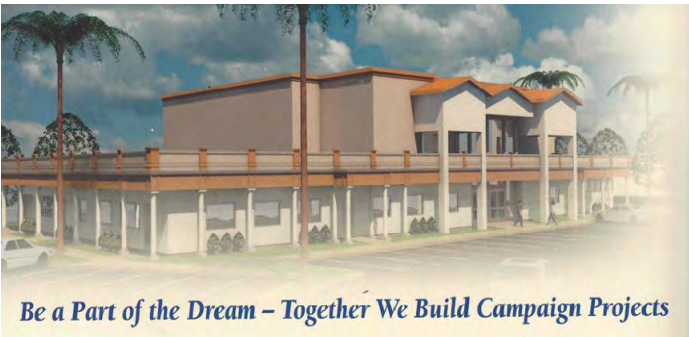
Be a Part of the Dream – Together We Build Campaign Projects

Almighty God, our Father, You who have given us life and intended us to have it forever, grant us Your blessings. Enlighten our minds to an awareness and to a renewed conviction that all human life is sacred because it is created in Your image and likeness. Help us to teach by word and the example of our lives that life occupies the first place, that human life is precious because it is the gift of God whose love is infinite. Give us the strength to defend human life against every influence or action that threatens or weakens it, as well as the strength to make every life more human in all its aspects. Give us the grace...when the sacredness of life before birth is attacked, to stand up and proclaim that no one ever has the authority to destroy unborn life. Give us courage to proclaim the supreme dignity of all human life and to demand that society itself give its protection. We ask this in Your name, through the redemptive act of Your Son and in the Holy Spirit. Amen.