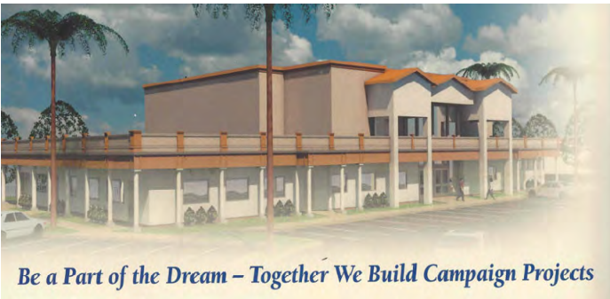
Be a Part of the Dream – Together We Build Campaign Projects

Our parish children's choir, the Heaven Sent Choir, is looking for elementary and junior high school aged children who are energetic and love to sing for God! If you are interested, please visit the information table in the Grotto area after Mass this weekend and next weekend.