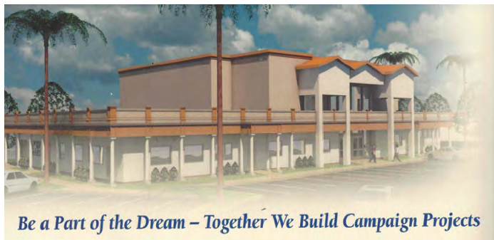
Be a Part of the Dream – Together We Build Campaign Projects

Could you not watch one hour with Me?” (Mark 14:37)