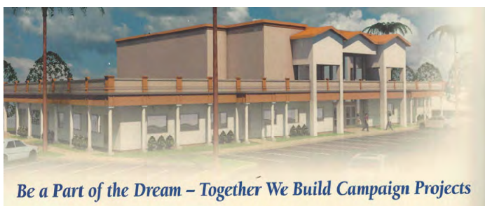
Be a Part of the Dream – Together We Build Campaign Projects

ANNUAL CAR RAFFLE / AUCTION on MAY 20th. For only $10, you'll get a chance to win one of these two car prizes, or both cars for only $20. Or, get 6 tickets for only $50 for each car. The more tickets you buy, the more chances you have to drive a blue or red 2017 Honda Fit, or take home both cars! Talk to a Committee member in the Court-